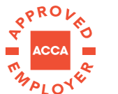
Practising Certificate Development